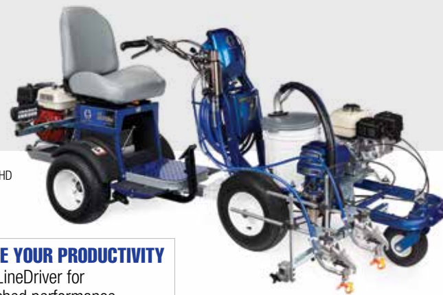
LineDriver HD 262005