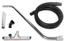
P12377 ANTISTATIC KIT PRO Ø 50MM Electrically conductive solution for maximum protection against static discharge. - 3 m of electrically conductive EVA - 2 anti-static r ...