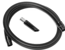
P12378 ANTISTATIC STARTER KIT Ø 50MM Certified basic configuration for charge dissipation on medium-diameter cables. - 3 m of electrically conductive EVA - 2 anti-static rub ...