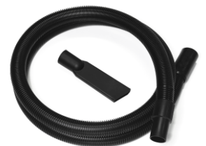
P13641 ANTISTATIC STARTER KIT Ø 40MM Safety kit for areas with electrostatic hazards, ideal for fine and conductive dust. - 3 m of electrically conductive EVA tubing - 1x50 ...