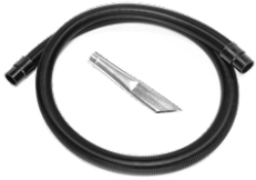
P12350 STARTER KIT Ø 50MM A compact, essential solution for quick vacuuming on simple surfaces. - 3-meter Evaflex hose - 2 antistatic rubber sleeves - Flat nozzle