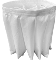
PTFE PTFE Filter (M class EN 60335-2-69)