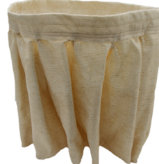
NOMEX 250° Celsius resistant filter