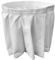
ANT M Antistatic filter (M class EN 60335-2-69)