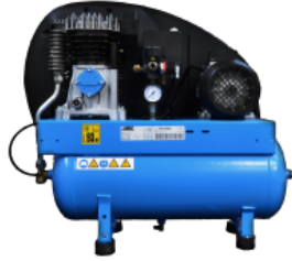
COM Compressor on board Compressor fitted on the back cover