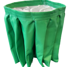
MTF Teflon filter (M class EN 60335-2-69)