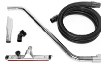
P12348 DRY KIT Ø 50MM Kit for cleaning large areas of dry dust that require high suction power. - 3-meter Evaflex hose - 2x antistatic rubber sleeves - Flat ...