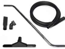
P13639 WET & DRY KIT Ø 40MM Versatile kit designed to easily switch between vacuuming dust and liquid debris. - 3-meter Evaflex hose - 1x 50/40 antistatic rubber ho ...