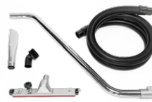
P11887 WET & DRY KIT Ø 50MM Robust system for suctioning large quantities of liquids and solid debris. - 3-meter Evaflex hose - 2x antistatic rubber sleeves - Flat ...