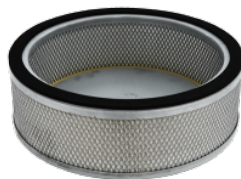
HEPA 14 Absolute filter (EN 1822) 28,000 cm 2 filter surface H14 Class Filter (EN 1822) Glass fiber