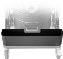
AB Accessories basket