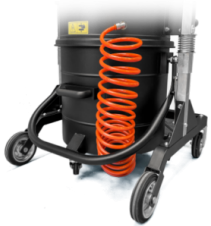
KDP Differential pressure KIT for bag