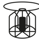
FLT Floater device