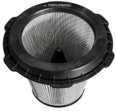
HEPA 13 Absolute filter (EN 1822) 35.000 cm 2 filter surface H13 Class Filter (EN 1822) Glass fiber