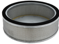
HEPA 14 Absolute filter (EN 1822) 22.000 cm 2 filter surface H14 Class Filter (EN 1822) Glass fiber