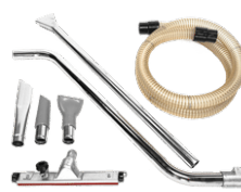
P12354 OIL & SWARF KIT PRO Ø 40MM Complete system for collecting oil and metal shavings, with specific accessories for every part of the machine tool. - 3 m of reinforced ...