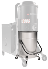
BX Stainless steel bin AISI 304