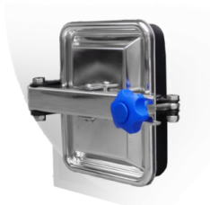
BIS Inspection door for internal maintenance