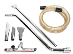
P12355 OIL & SWARF KIT PRO Ø 50MM Complete system for collecting oil and metal shavings, with specific accessories for every part of the machine tool. - 3 m of reinforced ...