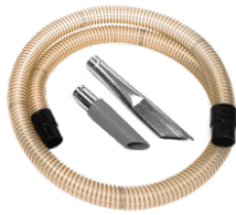
P12352 OIL & SWARF KIT Ø 50MM. Quick solution for vacuuming up metal scraps and oily residues in machine shops. - 3 m of reinforced polyurethane hose - 2 anti-static r ...