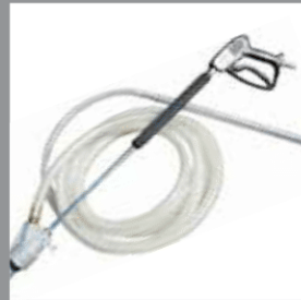
Sandblasting Kit 500 Bar