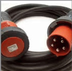
Extension Cable With Waterproof Connectors