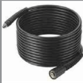
High Pressure Hose