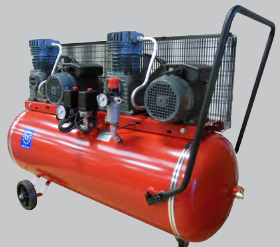
IBIX® E500 electrocompressor 2 x 220 volt 500 l/min

Additional Nozzle Kits Available for Purchase with all IBIX Units