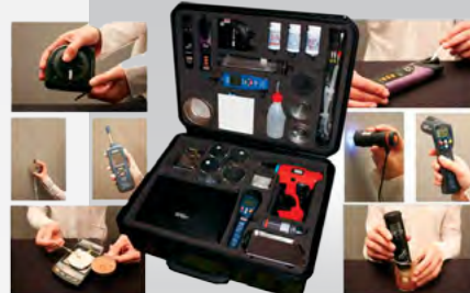
Mobile Lab Kit for Surface Analysis

Available for all units. Perfect for overhead work and tight places.