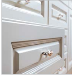
ΝΤΟΥΛΑΠΕΣ / ΕΝΤΟΙΧΙΣΜΕΝΕΣ