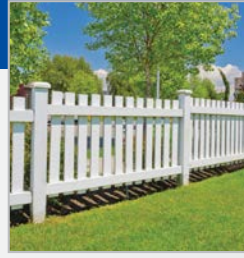
ΦΡΑΧΤΕΣ / ΕΠΙΠΛΑ